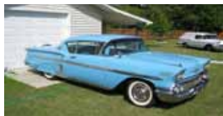
'58 Impala $32500