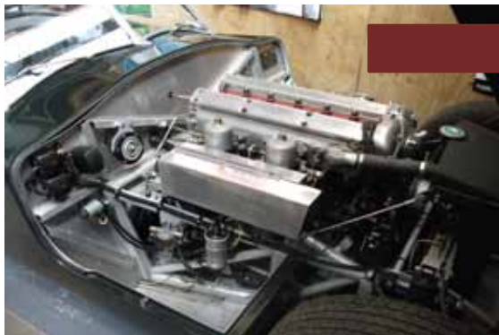
Look at this jag motor

the 't - type' at speed, what an awesome sight