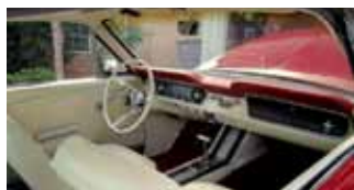
'65 Mustang $19800