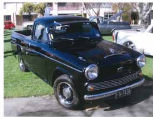
Special 13, a very tidy 1973 Austin ADO Ute with a relatively fresh coat of paint