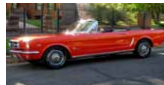
'65 Mustang $24500