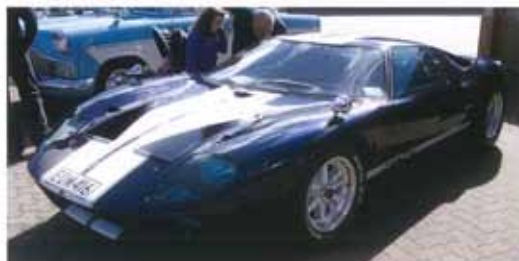
Special 18, for those who think Jeremy Clarkson knows what he is talking about and not just entertaining is a 2008 Ford GT40, very sleek.