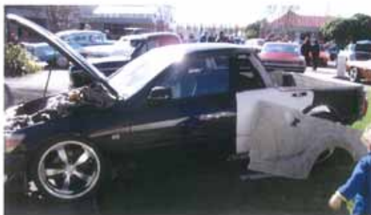
Special 14, 2000 Toyota Altezza, this 'car' has been heavily modified by being cut down into a ute and having a late model Corvette V8 shoe horned under the bonnet.