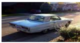
'64 T-bird $9800