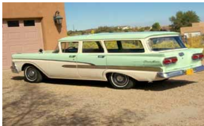
Eds Pick - '58 Ford Country Squire $14500 - Fab!

OK used cars were a feature of many a GM sales yard in the 60's. I 'am sure Bill would say all these examples are 'ok!'