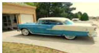
'55 Chev $32500