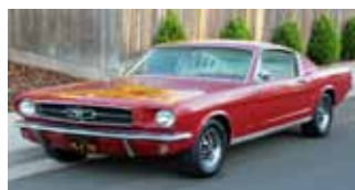
'65 Mustang $19800