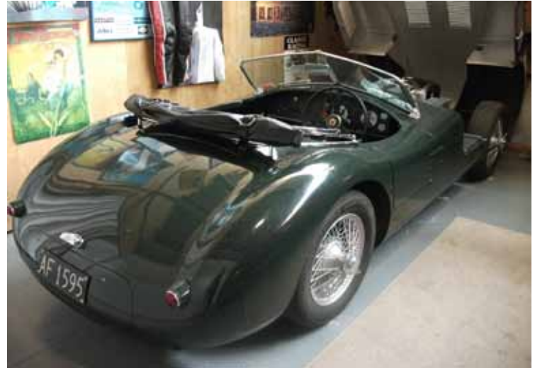
Jaguar t - type