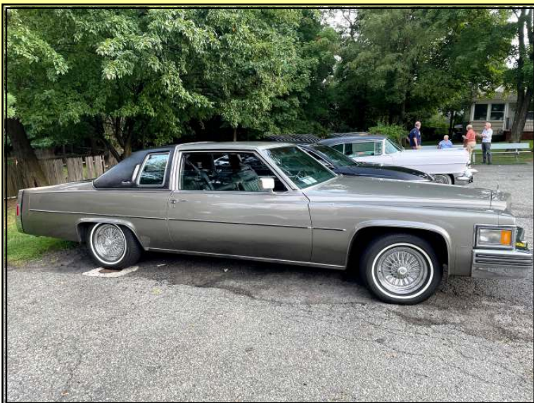
Franklin Rich's '78 Coupe DeVille, on special chrome wheels