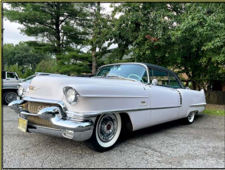
The Austins' glorious '56 Coupe DeVille