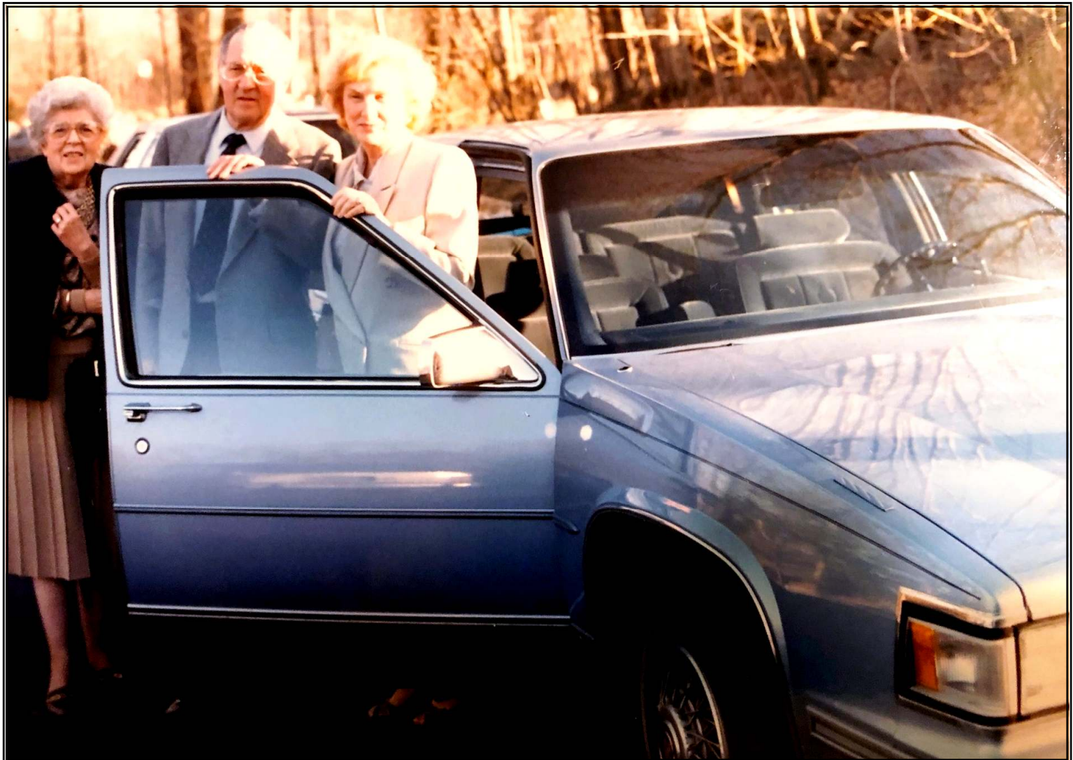
This picture was taken April, 1988, at our house in Paramus