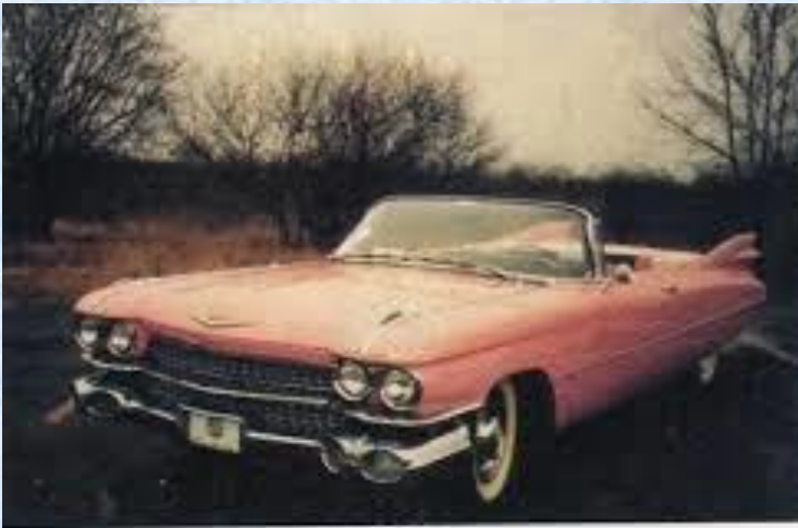
CADILLAC CABRIOLET, 1959, rose, very nice reasonable price, low miles, ex. Jane Mansfield Tel - 205 522 7500 Fax - 205 522 2387 (USA)

What famous Drummer purchased this 1959 Cadillac that was once owned by Hollywood Sex Symbol, Jane Mansfield?