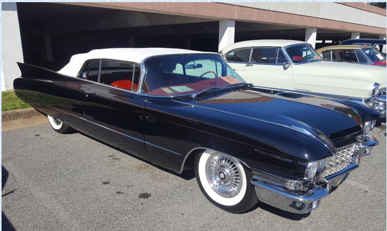
Modified 1960 Cadillac 6267 in black owned by Burt Zweibel of Fairfax, VA.