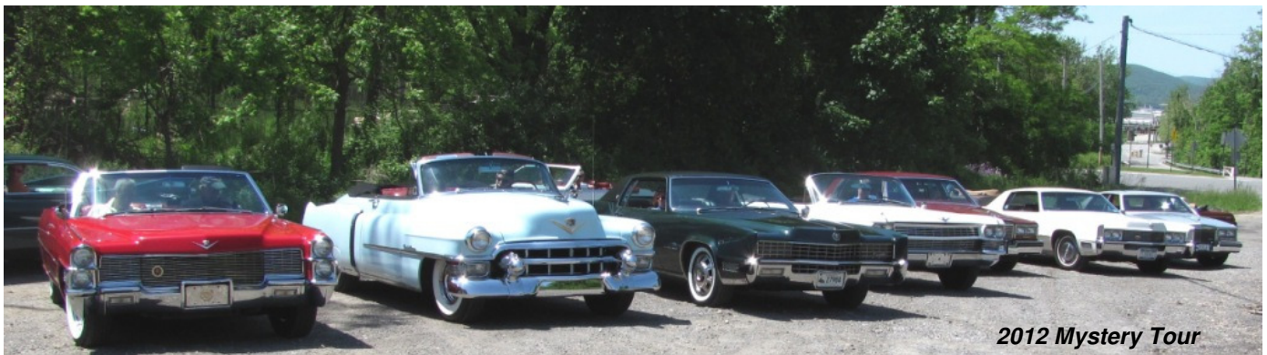
2012 Mystery Tour

The May 20 th "Mystery Tour and BBQ" was also a big success. A dozen Cadillacs (and two foreign jobs) took a 40-mile drive through time, retracing the route taken by Revolutionary War heroine Sybil Ludington, back in 1777. Ludington made this trip at night to warn the local militia that the British were invading Danbury. Her ride is well known through Putnam County, and we passed several historical markers and even a statue honoring her feat. Sybil is included in the NYS elementary school social studies curriculum. It was quite a sight to see our long and colorful fleet of Caddies wind its way through the skinny forest roads that must have been just dirt roads and cart paths not that long ago. It is hard to imagine what that route was like in 1777. At one point a few weekend warrior biker guys were