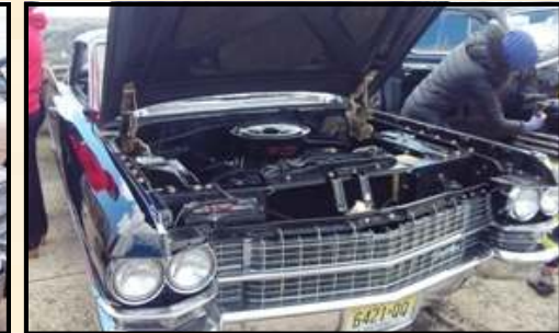
The Harriman's 1963 Coupe DeVille