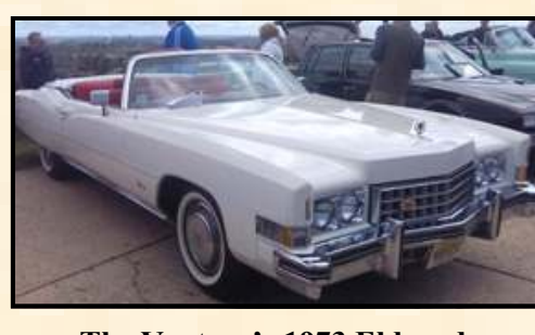
The Ventoro's 1973 Eldorado