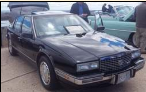
Tom Pirog's 1990 STS