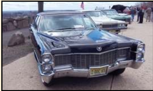
George Rienzo's 1965 Fleetwood