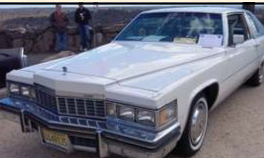
Louis Filardo's 1977 Coupe