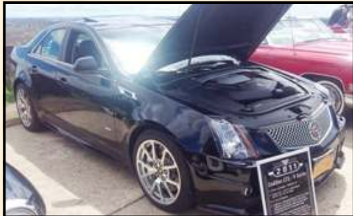
Joe Roglieri's 2011 CTS