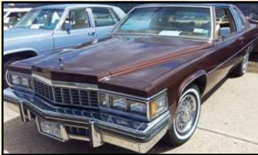
Bill Slinn's 1977 Coupe DeVille