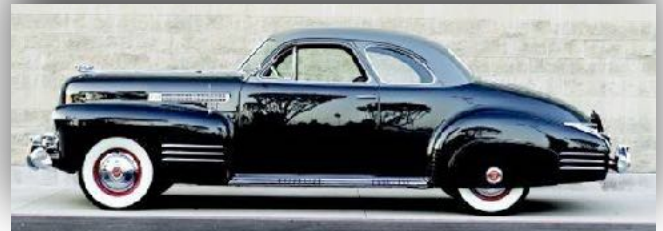
A Beautiful 1941 Cadillac Series 62 Deluxe Coupe