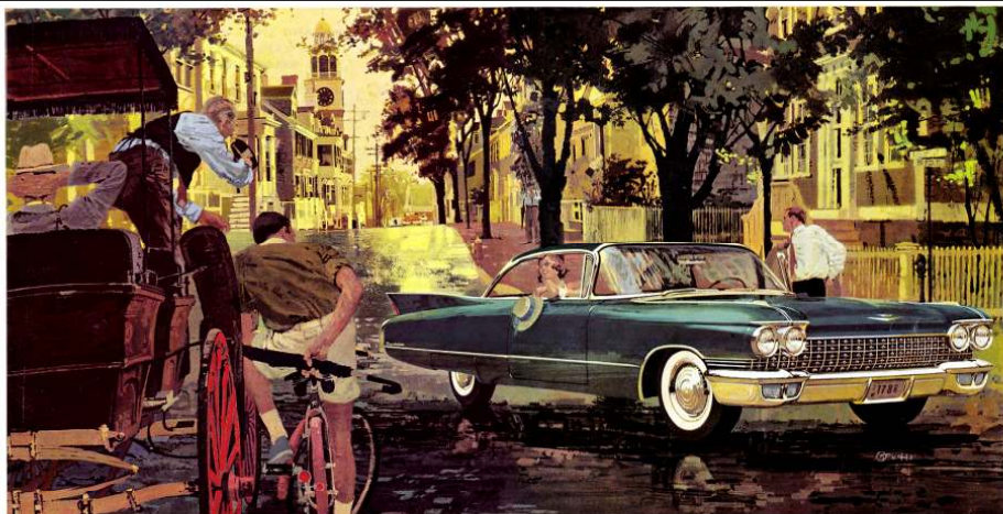
Old and new, but both steeped in tradition—Newmarket, Massachusetts, and a 1960 Cadillac Coupe de Ville