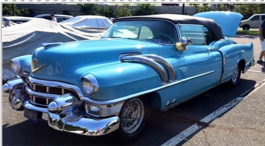
1953 factory supercharged Eldorado