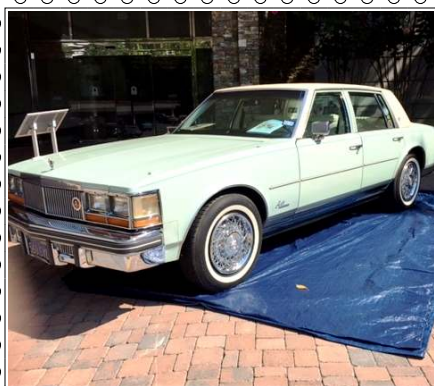
Betty White's Cadillac