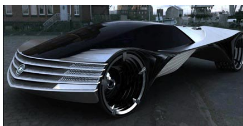
CLC/NWO REGION NEWS

Below: Cadillac concept car via the Internet