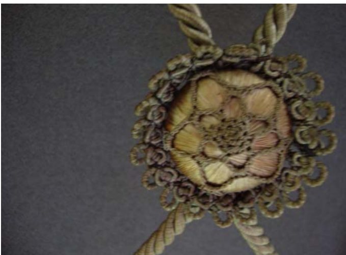
Rosette on Back Seat Roof