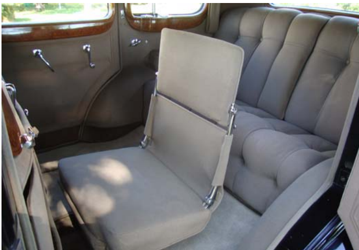
Original Rear Seat Upholstery