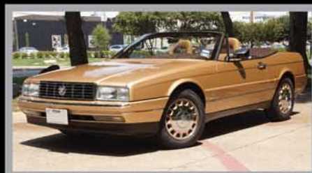
1987 CADILLAC ALLANTE CONVERTIBLE