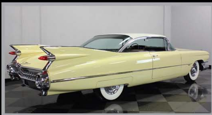
1959 CADILLAC SERIES 62 COUPE