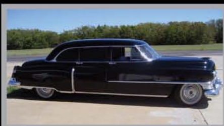
1952 CADILLAC FLEETWOOD 75 LIMO