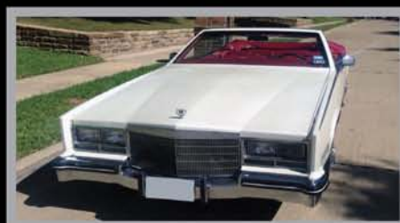
1985 CADILLAC ELDORADO BIARRITZ CONVERTIBLE