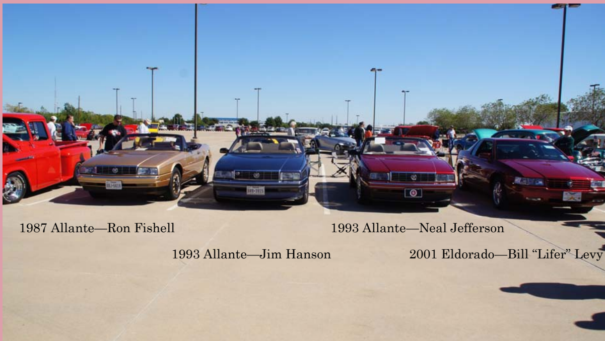
1987 Allante—Ron Fishell