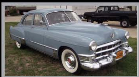
1949 CADILLAC SERIES 62 SEDAN