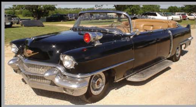
1956 CADILLAC LIMOUSINE CONVERTIBLE, "PARKLAND" MOVIE CAR