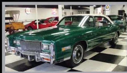
1976 CADILLAC ELDORADO CONVERTIBLE