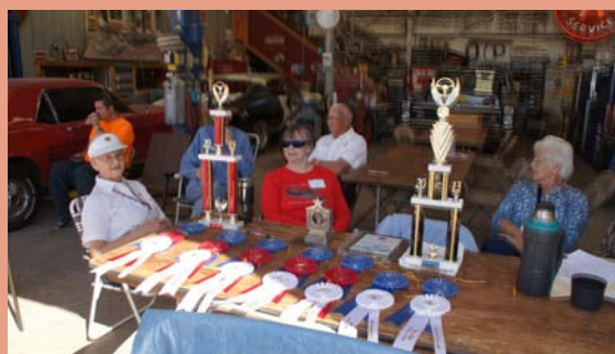
Here is a view of the trophies for this meet.