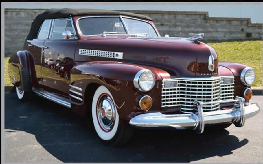
1941 CADILLAC SERIES 62 CONVERTIBLE SEDAN