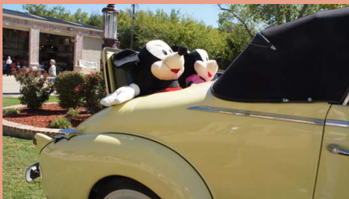
Mickey sang and Minnie warbled that "Gee, our old LaSalle ran great . . ."