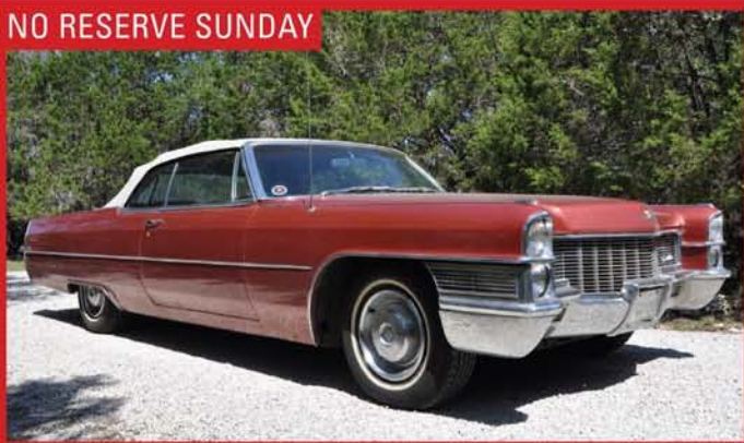
1965 CADILLAC DEVILLE CONVERTIBLE