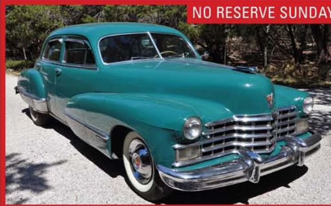
1947 CADILLAC SERIES 62 SEDAN