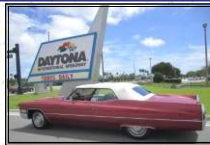
Spring Show views from the ground and the air; Bob Walton's "Big Red" at the Daytona Speedway (see story on page 7)