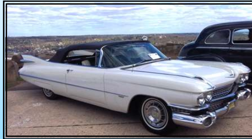
Dominick Tucci — 1959 Convertible