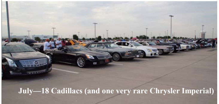
July—18 Cadillacs (and one very rare Chrysler Imperial)

August 4th, Cars and Coffee, 8am – Noon. Get there NLT 7:15 for a reserved spot on Cadillac Row as the lot fills up fast after 6:45 am. 6800 Dallas Parkway, Plano TX 75024 email lifer@writeme.com that you will be there.