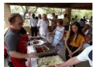
More Picnic Pictures in newsletter, Facebook, and the website