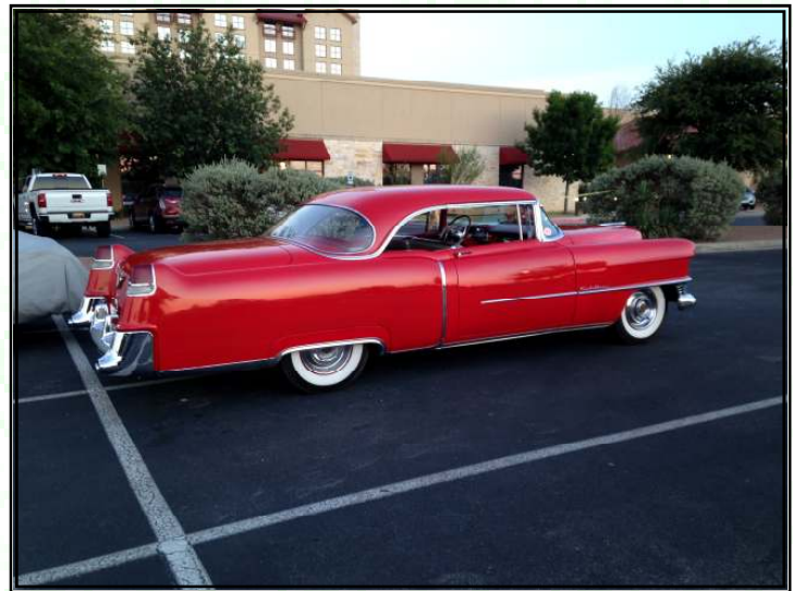
A 1955 in a beautiful red color.