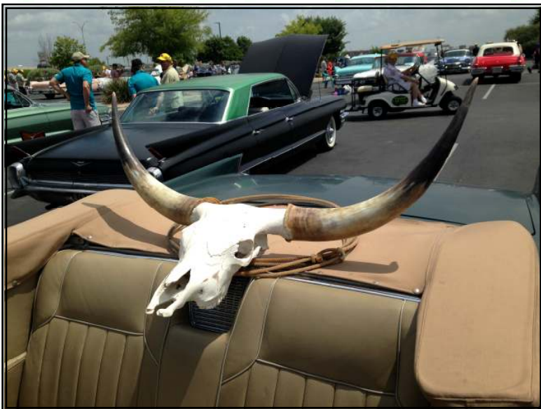
It's a little hot in Texas!