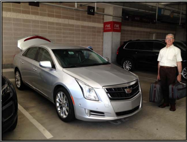
Austin airport car rental - our Cadillac XTS