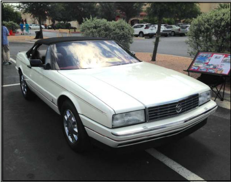
Sal Santoro's 1992 Allante