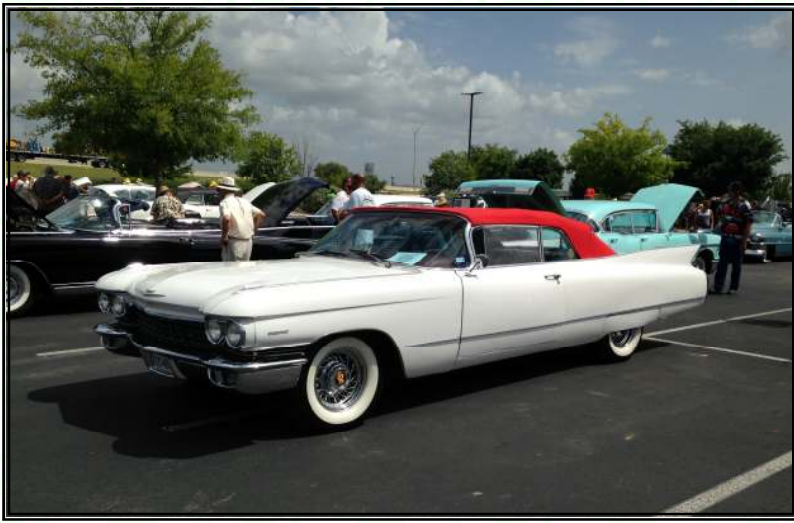
A 1960 convertible