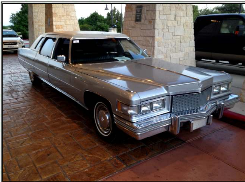
1975 Cadillac Limo

above from CLC Museum & Research Center for our CCNJ Grand National gift.