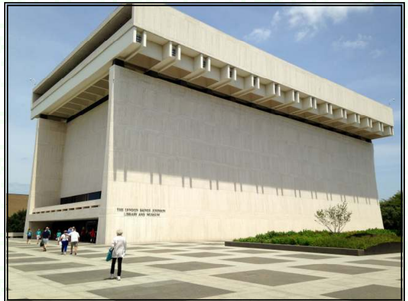
LBJ Library and Museum