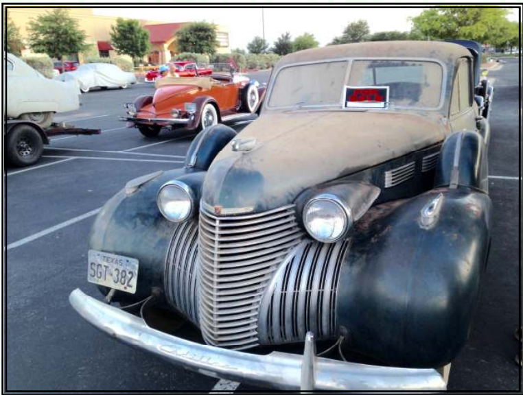
Fresh barn find, sold by the time I asked about it.