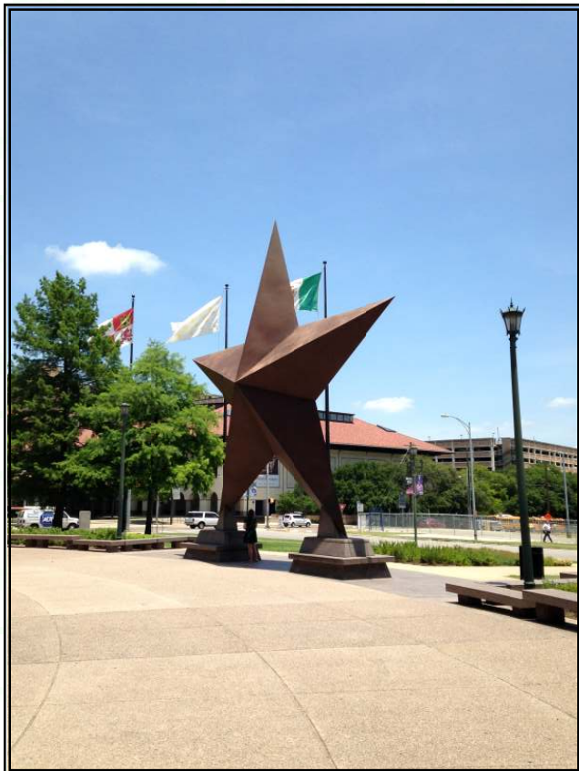
“The Story of Texas” - The Bullock Museum