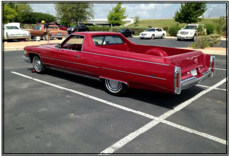
A 1975 Cadillac Mirage