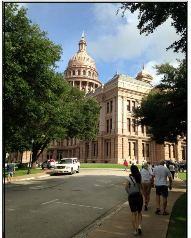
Capital of Austin, Texas