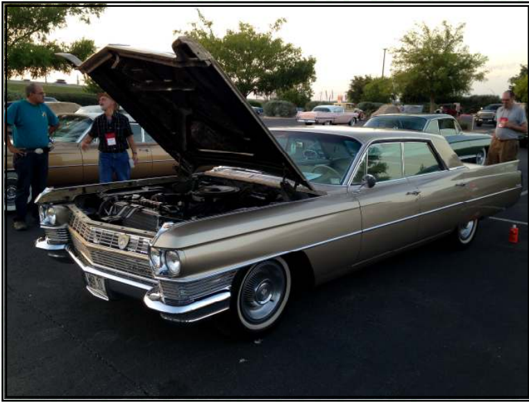
1964 Sedan DeVille brought here from Willemstad, Curacao, South America.