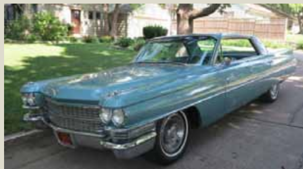
Sample pics only of 1925 Maxwell Roadster and 1963 DeVille Sedan