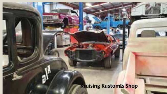
Kruising Kustom's Shop