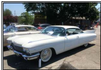
Dennis Ragucci — 1960 Series 62 Coupe