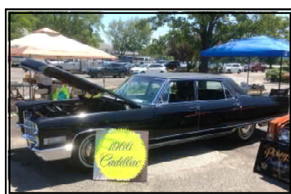
Tom Pirog — 1966 Fleetwood 60 Special Brougham