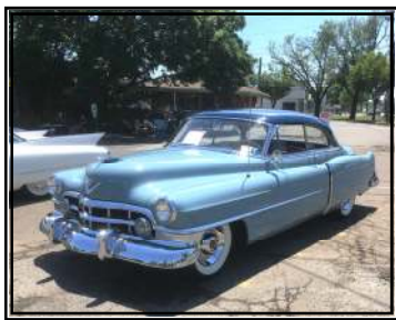
Joe Hickey — 1950 Series 61 Club Coupe