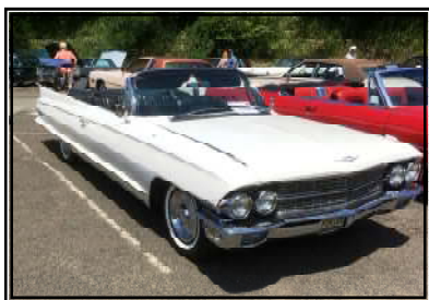
Jerry Panaccione — 1962 Series 62