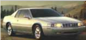
2001 Cadillac Eldo

Here at the bottom of world, we couldn't believe what was being bestowed on the World's greatest country