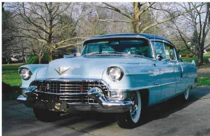
BOB CRIMMINS' 1955 Cadillac Fleetwood 60 Special sported air conditioning.