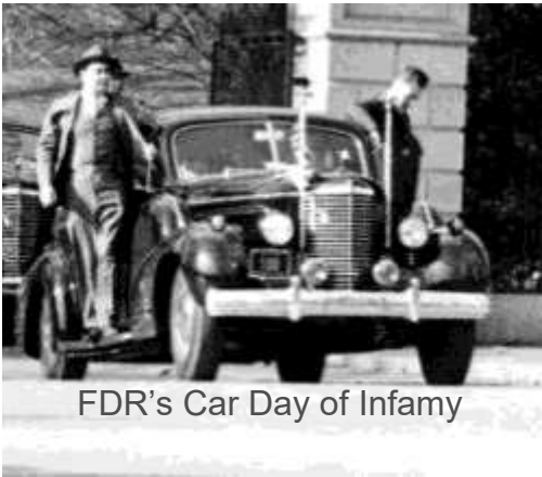
FDR's Car Day of Infamy

do that, and nobody had time for that. One of the Secret Service members, however, discovered that the US Treasury had seized the bulletproof car that mobster Al Capone owned when he was sent to jail in 1931. They cleaned it, made sure it was running perfectly and had it ready for the President the next day. Mechanics are said to have cleaned and checked each feature of the Caddy well into the night of December 7th, to make sure that it would run properly the next day for the Commander in Chief. And run properly it did. It had been painted black and green to look identical to Chicago's police cars at the time. To top it off, the gangster's 1928 Cadillac Town Sedan had 3,000 pounds of armor and inch-thick bulletproof windows. It also had a specially installed siren and flashing lights hidden behind the grille, along with a police scanner radio.