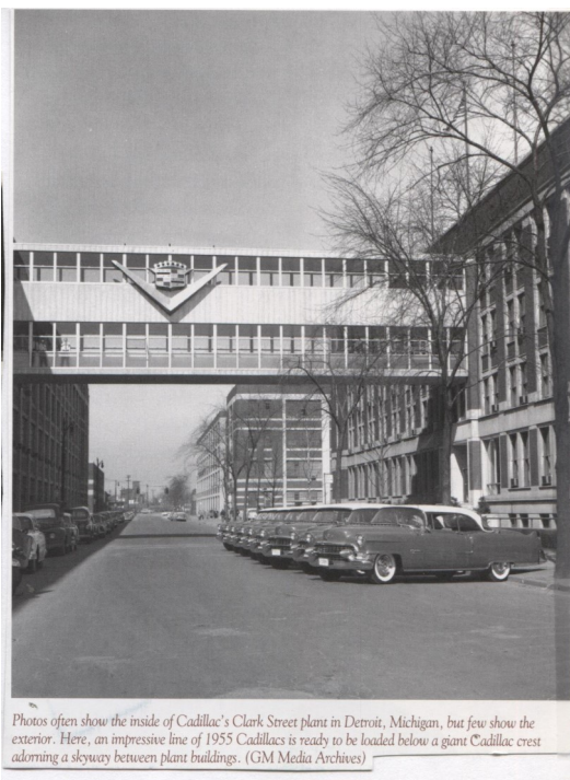
Photos often show the inside of Cadillac's Clark Street plant in Detroit, Michigan, but few show the exterior. Here, an impressive line of 1955 Cadillacs is ready to be loaded below a giant Cadillac crest adorning a skyway between plant buildings.