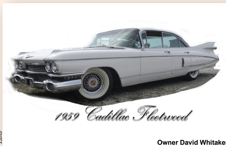
1959 Cadillac Fleetwood