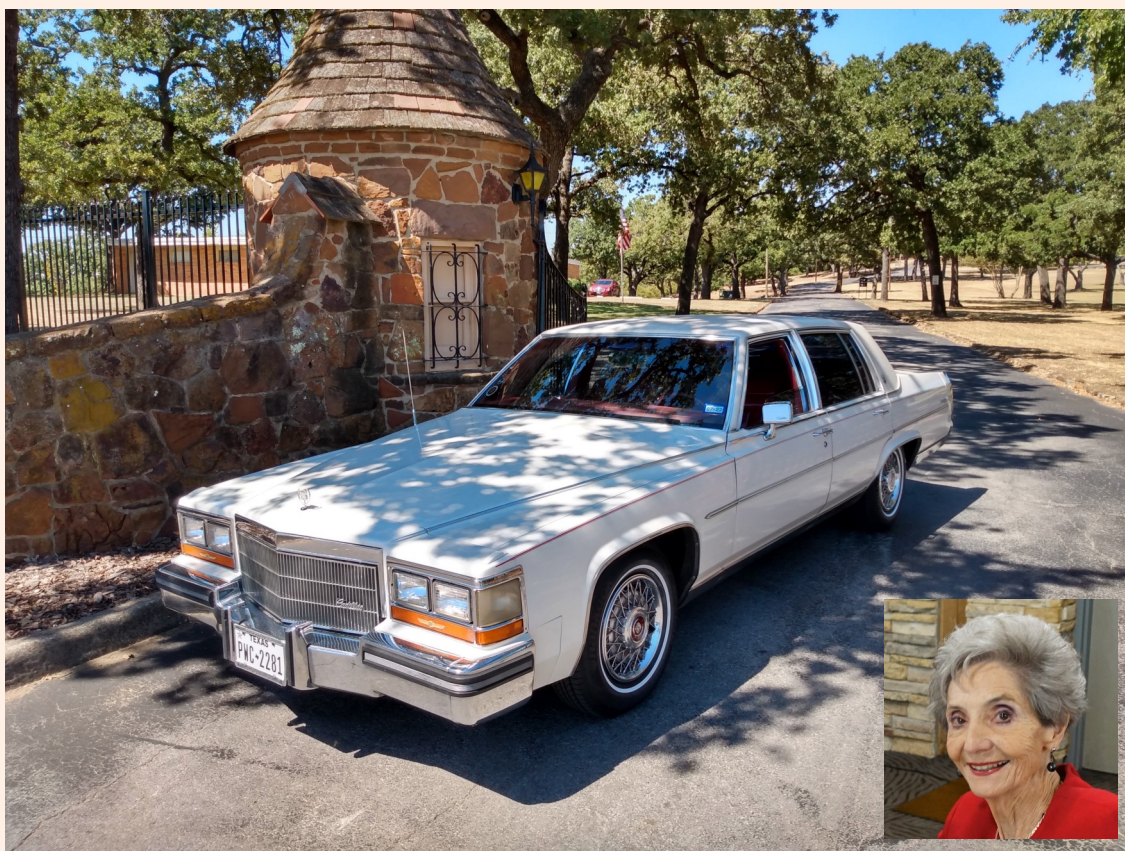
Ruby's New Ride 1986 Fleetwood Brougham