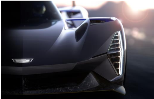
CADILLAC GTP PROTOTYPE

With Cadillac in the midst of defending its 2021 IMSA Manufacturer Championship, the brand continues to prepare for its return to the world racing stage. Cadillac Design is in the process of shaping the forthcoming GTP race car and the future of Cadillac Racing.