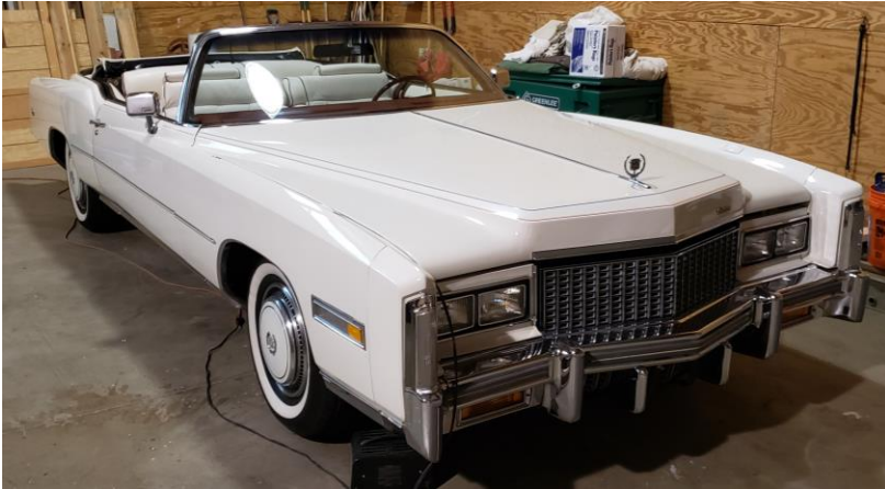
1976 BICENTENNIAL ELDORADO

The Bicentennial Eldorado was a special edition of 200 identical cars produced to mark the end of regular production convertibles in the USA. You can have a once-in-a-lifetime opportunity to see this car in person at a coffee and donut open house on Saturday March 26 th at 9:00 am.