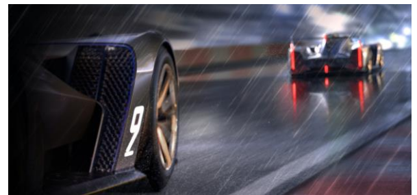
CADILLAC GTP PROTOTYPES