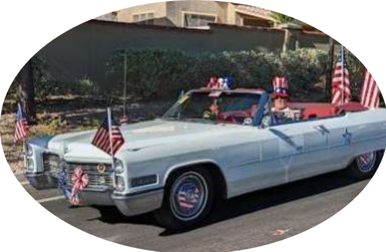
The Cadillac Club Parade Master