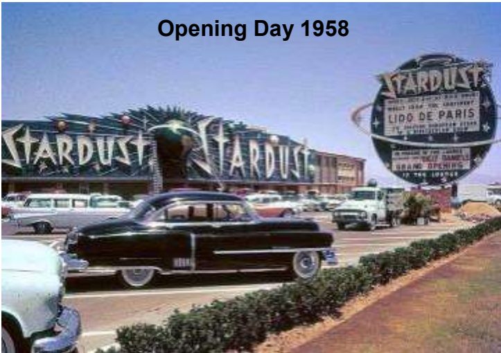
Opening Day 1958