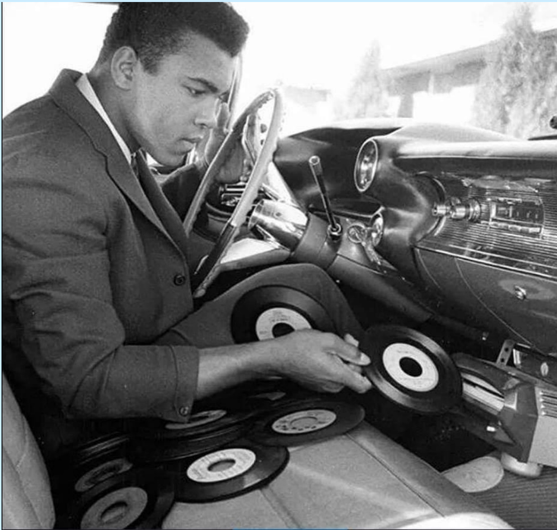
Muhammad Ali with his 1960 Cadillac 6237L

December/January 2023 Newsletter Volume 7 Issue 2