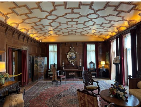
Left: Living room of the Ellwood House.