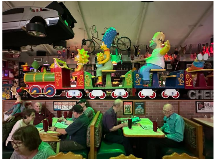
Clockwise from above: Old School building that houses Old School Pizza. Cartoon characters and movie memorabilia fill the restaurant. Cartoon statues in the schoolyard. Scary Tiki Monster and Dan Graziadei (or vice-a-versa).

The day wrapped up with dinner at the Old School Pizza restaurant. The Old School Pizza restaurant got its name by being located in.....wait for it.....an old school house. What makes the restaurant interesting is their collection of TV, Movie, toy and car memorabilia displayed in the building.