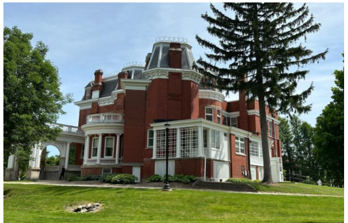
Above: The Ellwood House exterior.