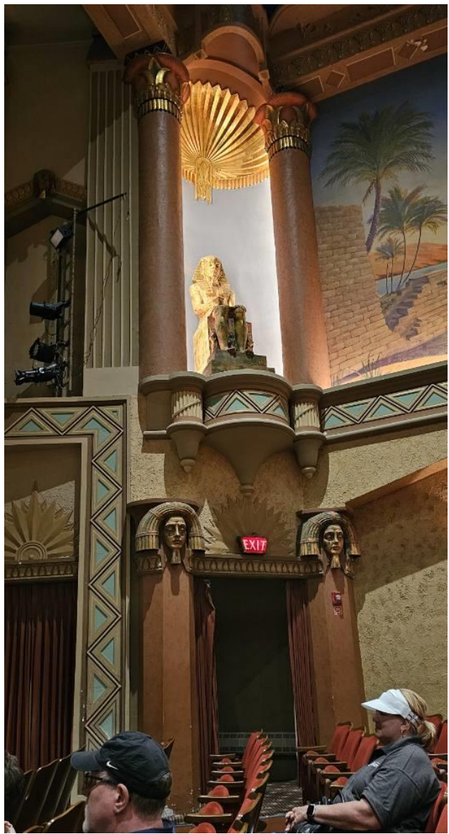
Clockwise from above: The Egyptian Theater in DeKalb, interior Egyptian themed décor, the view of the stage and wall murals from the balcony.

West of the Lake Region Members and their families spent a Sunday in DeKalb, Illinois touring the Egyptian Theater, the Ellwood Museum and dinner at Old School Pizza.