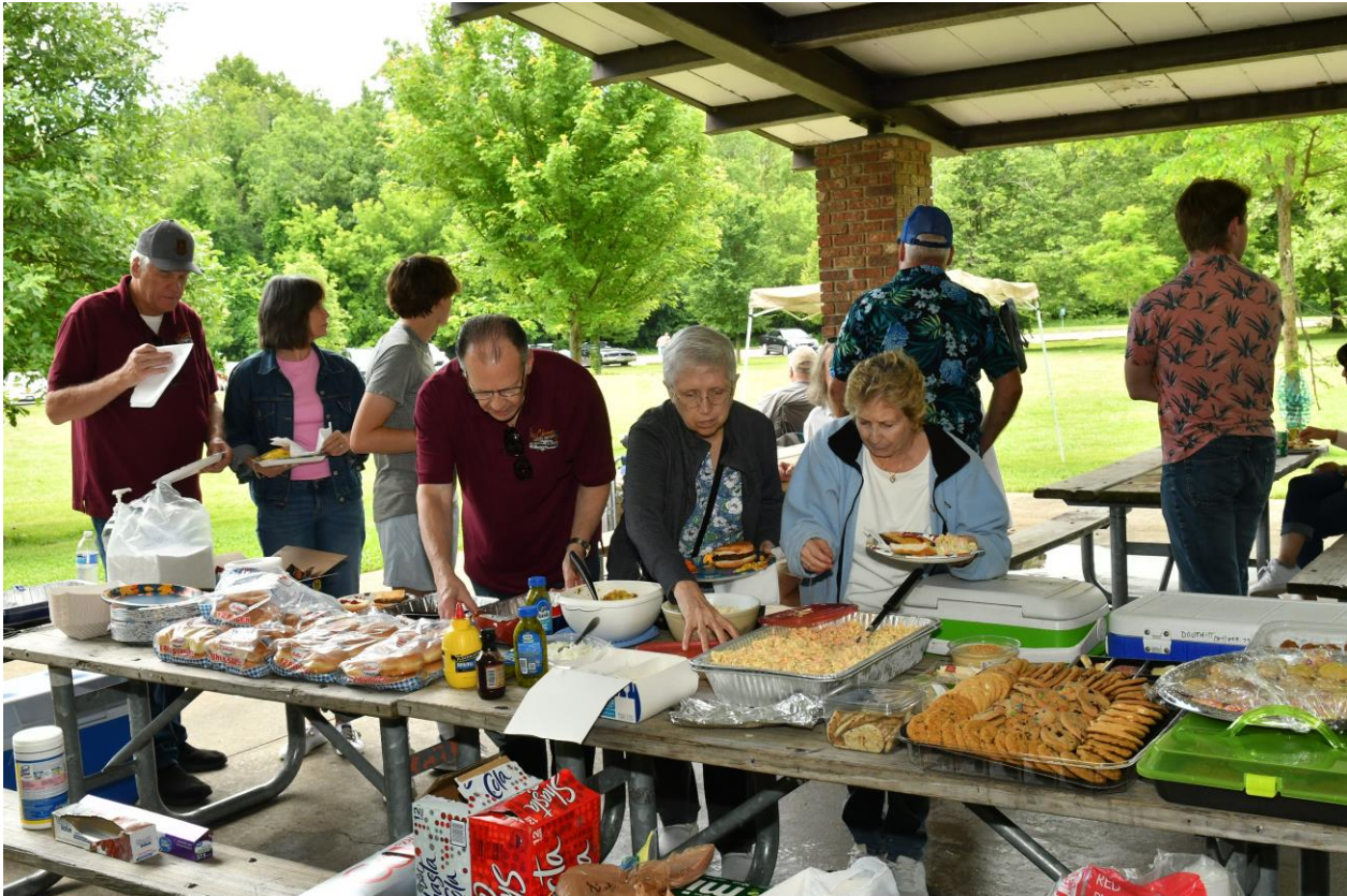
Below: The crowd lines up to enjoy the goodies!