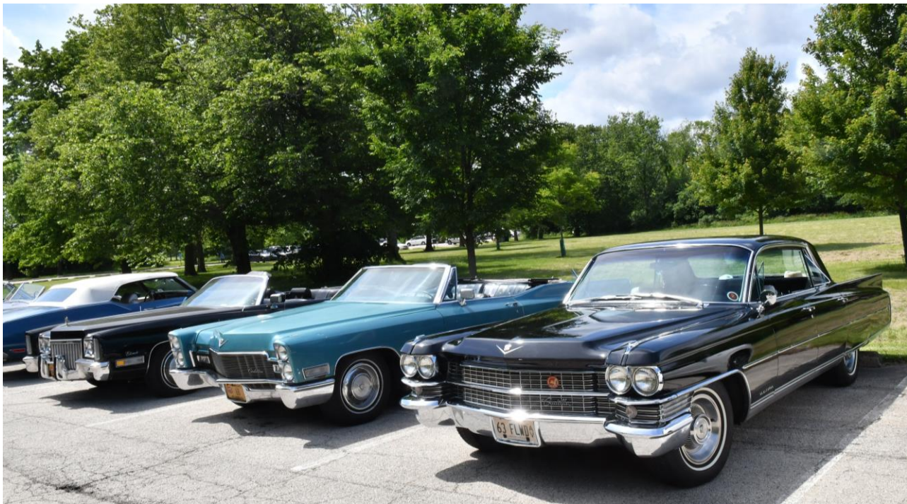
Plenty of nice cars were driven by our members and they attracted lots of attention from other park users.