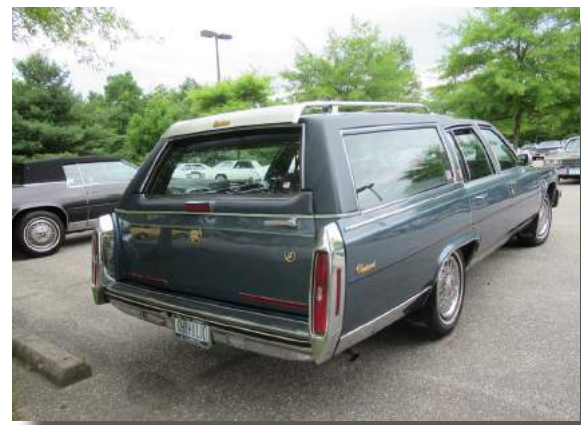
1987 Fleetwood Wagon - Very unusual