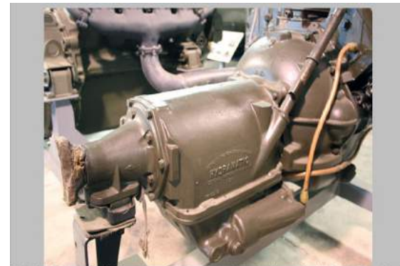
This World War Two Hydramatic 250-T Transmission was seen at the now defunct Ripkey Armor Museum in Crawfordsville, IN. The transmission is attached to a Cadillac V-8 and would have seen applications in the M5 series tanks, M5 motor gun carriages, and the LV7C3.