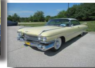
< 1959 Coupe deVille > 1962 Coupe deVille