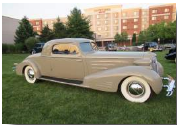
1934 Coupe 1985 Seville is below Left