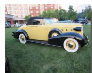
< 1935 LaSalle Convert. > 1937 LaSalle Coupe