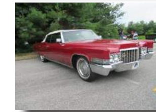
< 1970 Coupe deVille > 1976 Calais