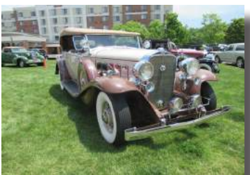
1932 280 Phaeton