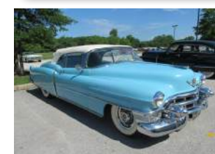
< 1953 Eldorado > 1956 Coupe deVille