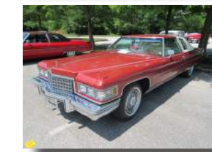
< 1976 Coupe deVille > 1976 Eldorado