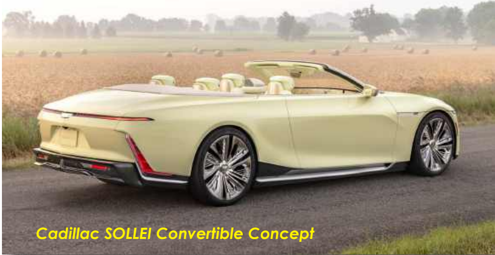
Cadillac SOLLEI Convertible Concept