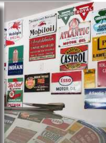
Can you see the NZ signage? Atlantic is pure Kiwi-ana! The factory 'Amethyst' colour is one of my all-time favourite Cadillac colours - Ed