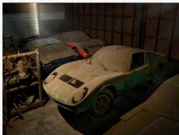
The online scrapyard has sat untouched since Rex Klein passed away in 2001 and has become a place of legend among car enthusiasts.

Thanks to past member, Rex Findlay in Auckland, comes a suggestion to check out an extensive cleaning job of a 1951 Caddy that had been a 'barn find' after parked-up for more than 30 years. The result, pretty jolly amazing!