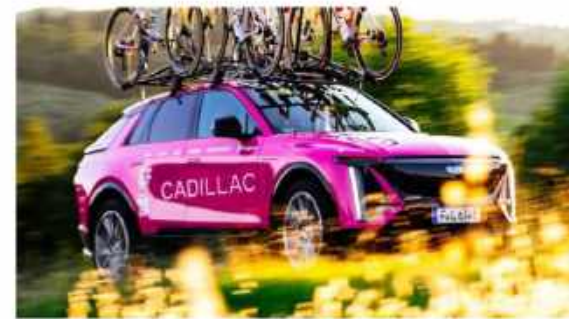
The Cadillac Lyriq EV successfully completed the Tour de France (June 29-July 21).

Cadillac Lyric on the 2024 Tour de France - not to be confused with Lycra! General Motors' European subsidiary says the Cadillac Lyriq at the 2024 Tour de France helped the race's EF Pro Cycling team from start to finish.