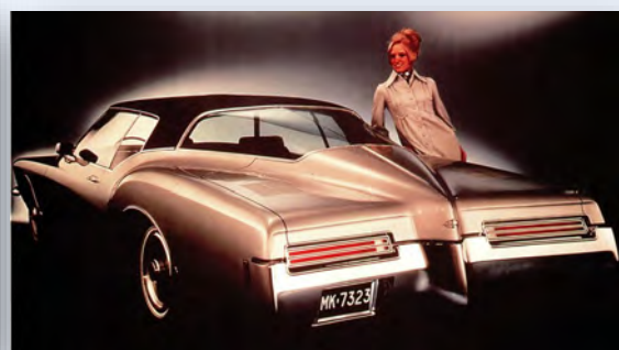
1971 Buick Riviera boat tail . Note deck lid