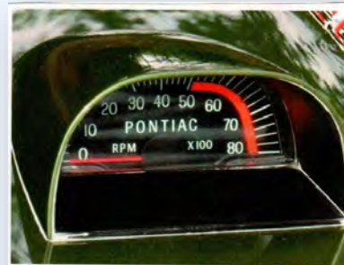
Pontiac's innovative optional tachometer was on the hood, whereas the Camaro's optional tach was placed in the right-hand gauge bezel.