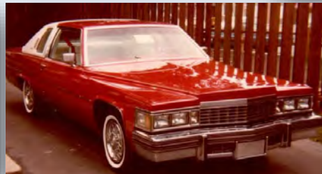
New 1977 Coupe DeVille my demo