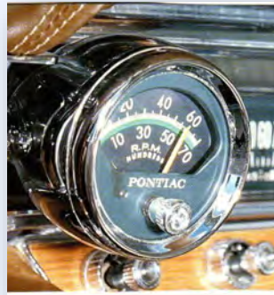
Factory exclusive 1962-1965