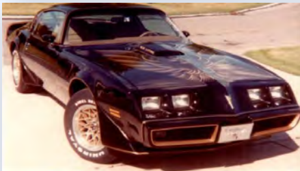
New 1979 Trans Am author's demo