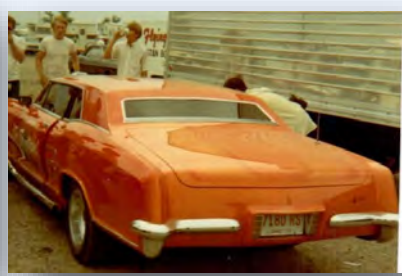
Rear view 1965 Riviera with GTO front end restricted area

Near right: 1963 Grand Prix note new concave back window. Tow vehicle is a Buick that reads "Have hearse—will travel?" GP deck lid "rather fight than switch." Far right: Indy 1970 Don (Big Daddy) Garlits king of dragstrips. 1975 and NHRA record at 250 mph,