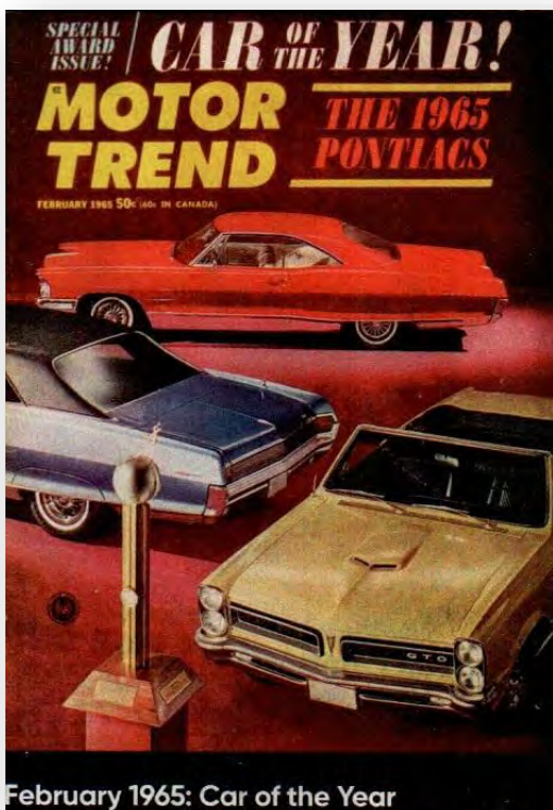
February 1965: Car of the Year

First time ever Motor Trend car of the year award was to the entire Pontiac car line for 1965. From Grand Prix to GTO, anyone can tell, they are all Pontiacs. Test crews had the time of their lives putting six Pontiac models through paces. Pontiacs deserved the award. Pontiac was Motor Trend's car of the year in 59, 61, 65, and lastly the 68 GTO.