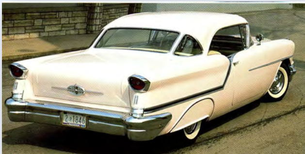
1957 Olds and Buick—one year only 3 window