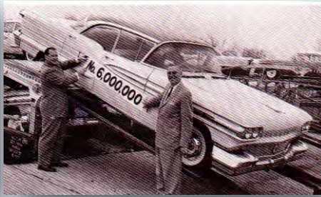
1958 Oldsmobile sold 6,000,000 All GM Body by Fisher