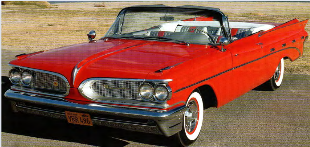
1959 Pontiac Bonneville Motor Trends car of the year sold 383,320 units. Cadillac was