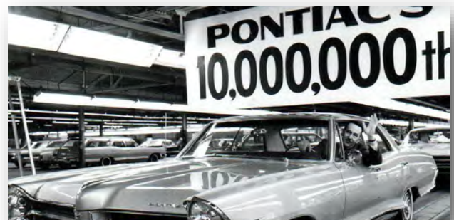
Pete Estess in a 1965 Pontiac Catalina