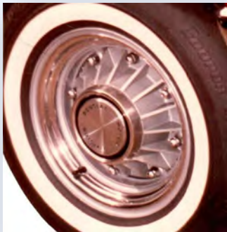
Pontiac 8 lugs 1960-1968