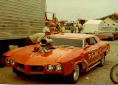
Never before seen 1965 Riviera with 1970 GTO front end

The BOPC 2nd annual car show will be at First Grapevine Methodist Church. You need to bring your BOPC to display or come to see the timeless cars. I am a member of the Lone Star chapter for POCI. Pontiacs have been a big part of my selling life from 1965-1974. I am also a member of the NTX CLC. Cadillacs were my selling life from 1970-2001. Most Cadillac owners have a deep appreciation and affection for all cars including all sister division GM vehicles and love to talk about them. Cars featured here are not in the show.