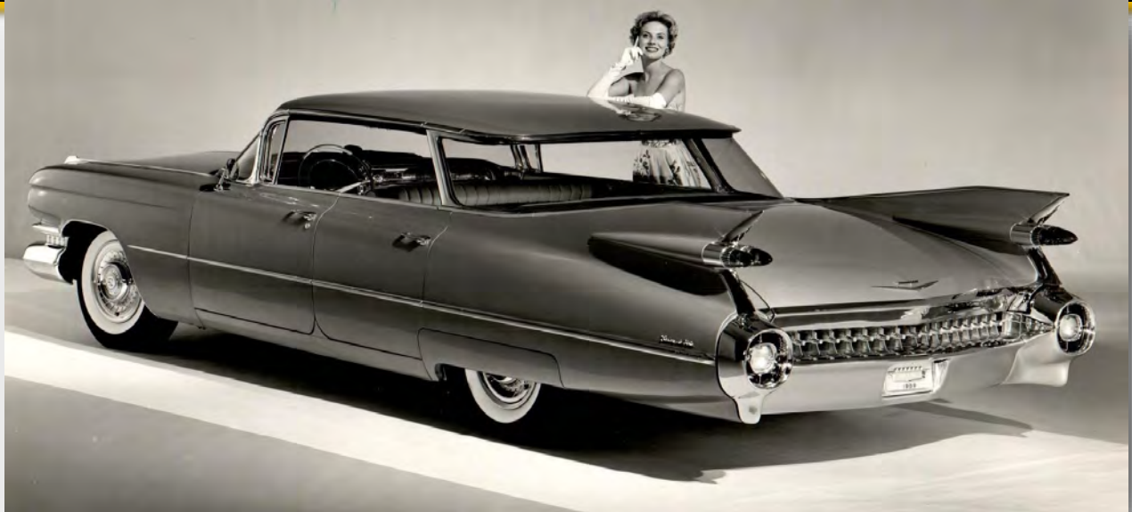
1959 Cadillac Sedan DeVille with GM exclusive cantilever flat top available 1959 and 1960 only

The international styling wrap around back window above was an exclusive LOF glass (distortion free) from Advanced Engineering Rossford, Ohio, to Tech Center, Detroit. All glass was safety plated. GM's 2nd highest profit 873 million nearly matched cost of emergency 1959 change over.