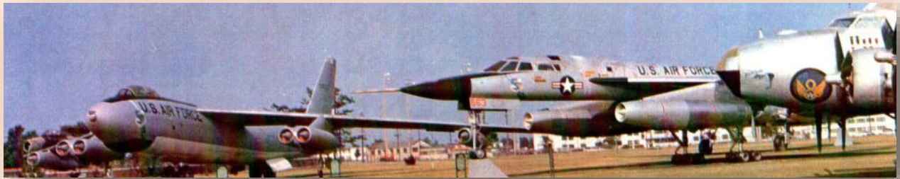
B-47, B-58 world’s fastest in 1957, B-17 WWII, 8th A.F. England, 305th Bomb Wing S.A.C.