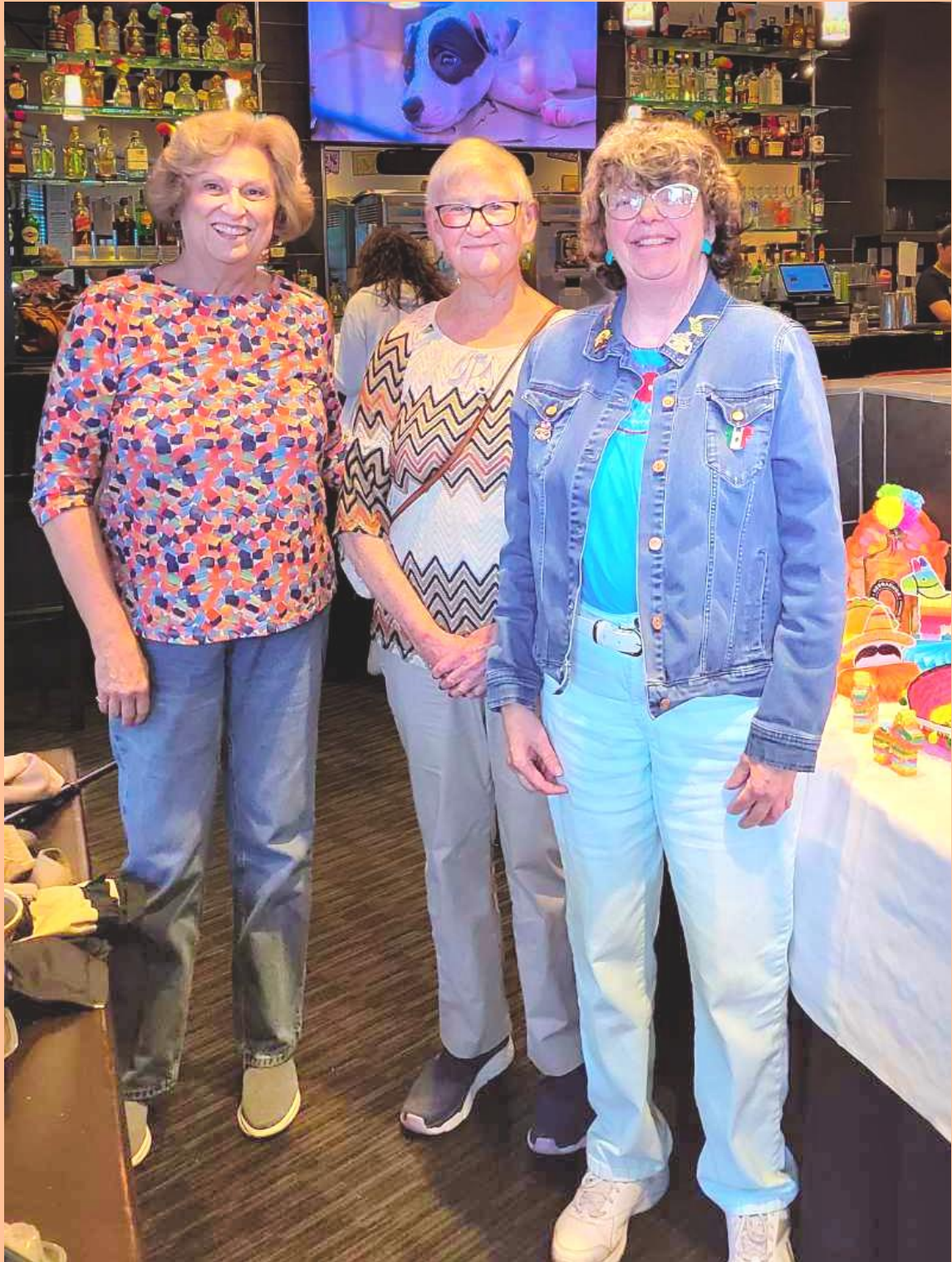
Caddy Girls at Fernando' on Cinco de Mayo.