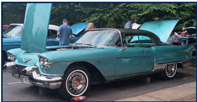
(<—1958 Eldorado Brougham, left).

The end of the decade introduced the 1959 bullet-shaped taillight incorporated into extremely-tall rear tailfins, a trademark that will live forever. Four nice models were on display representing this mile-stone year. A Carmine Red Convertible, a Coupe de Ville in white-over-blue (below-right), a matching Sedan de Ville Flattop (bottom-left), and the queen herself, an Eldorado Biarritz Convertible (bottom-right) in silver-blue metallic.