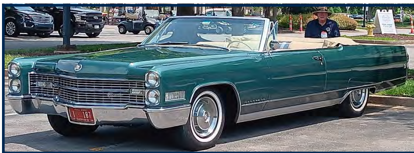
(←1966 Fleetwood Eldorado, left).