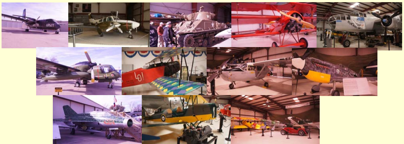
Some of the fantastic inventory at the Cavanaugh Flight Museum