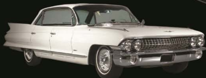
1961 CADILLAC SERIES 62 SIX WINDOW SEDAN