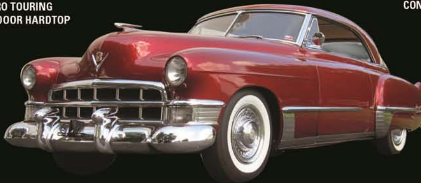
1949 CADILLAC PRO TOURING TWO DOOR HARDTOP