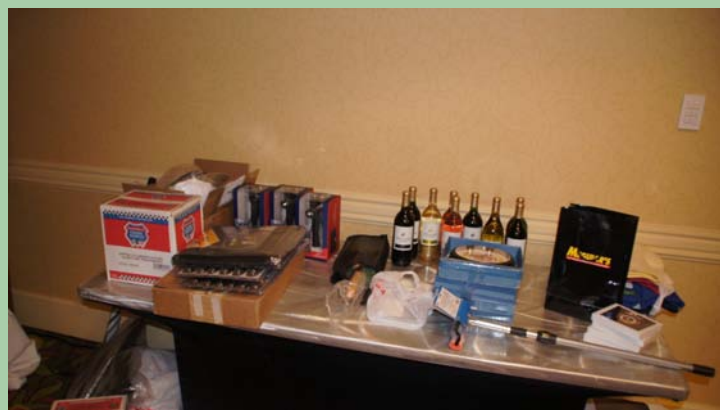
Awards and prizes—everybody went home with something.