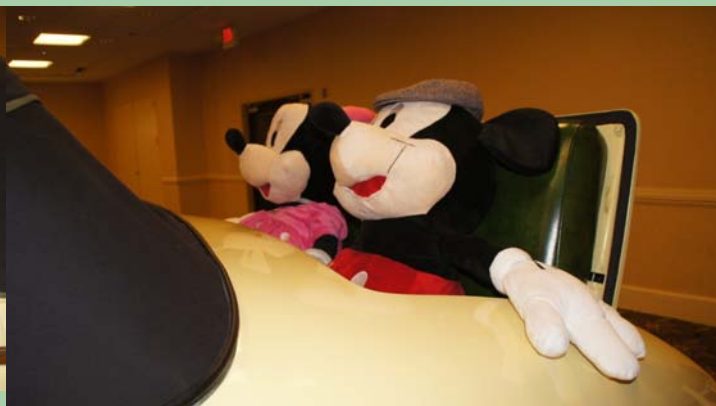
Some of our guest had a special chauffeur service—what a fun way to arrive at a fancy dinner.