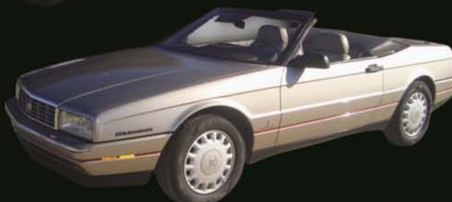
1993 CADILLAC ALLANTE CONVERTIBLE