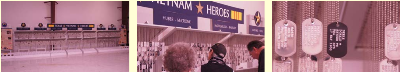
3,417 Dog tags represent the Texas Military members that gave their life for American Freedom.